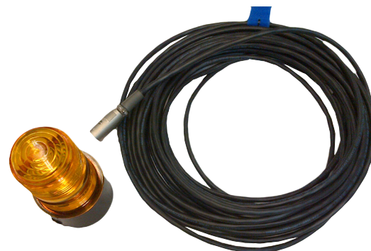
HV Strobe and Leads Cat # 1004-639 Length: 60 ft (18 m) Weight: 2.3 lb (1.1 kg)